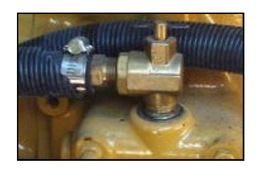
Double o-ring protection provides over 20,000 cycles without leakage! The exclusive stem seal design that never needs tightening!